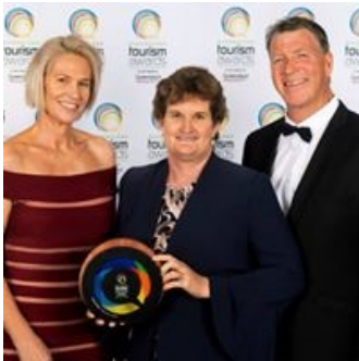
Cobbold Village won Gold for Hosted Accommodation and were inducted into the Tourism Hall of Fame