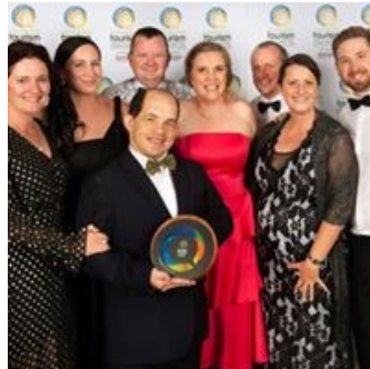
Capricorn Caves won Gold in the Tourist Attraction Category