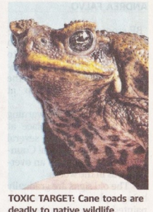
TOXIC TARGET: Cane toads are deadly to native wildlife.

"DNA contains ancient fragments of viruses – the DNA of every animal can sometimes catalogue past infections," Ms Russo said.